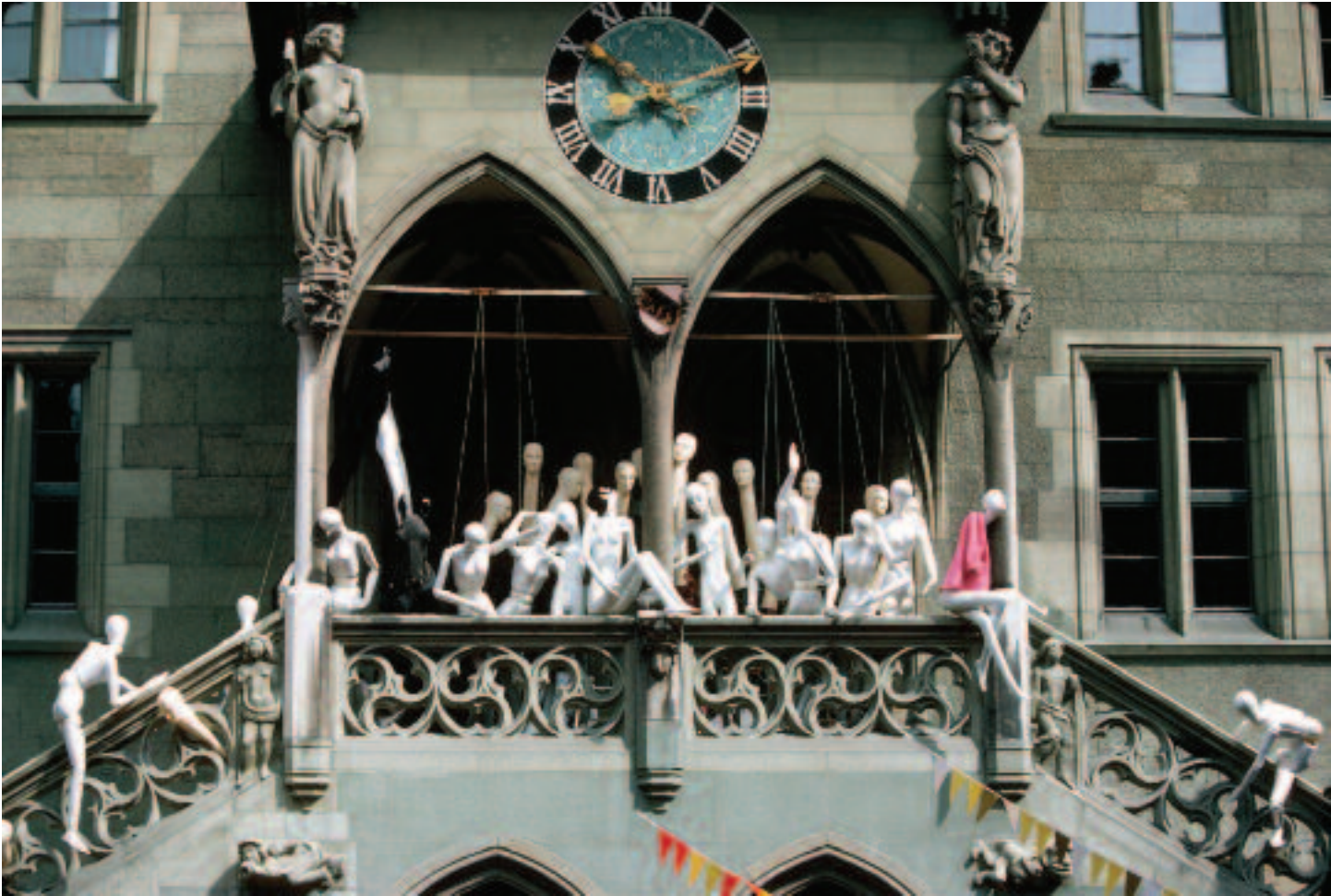
A display of puppets outside a historical building: is this a comment about politicians?