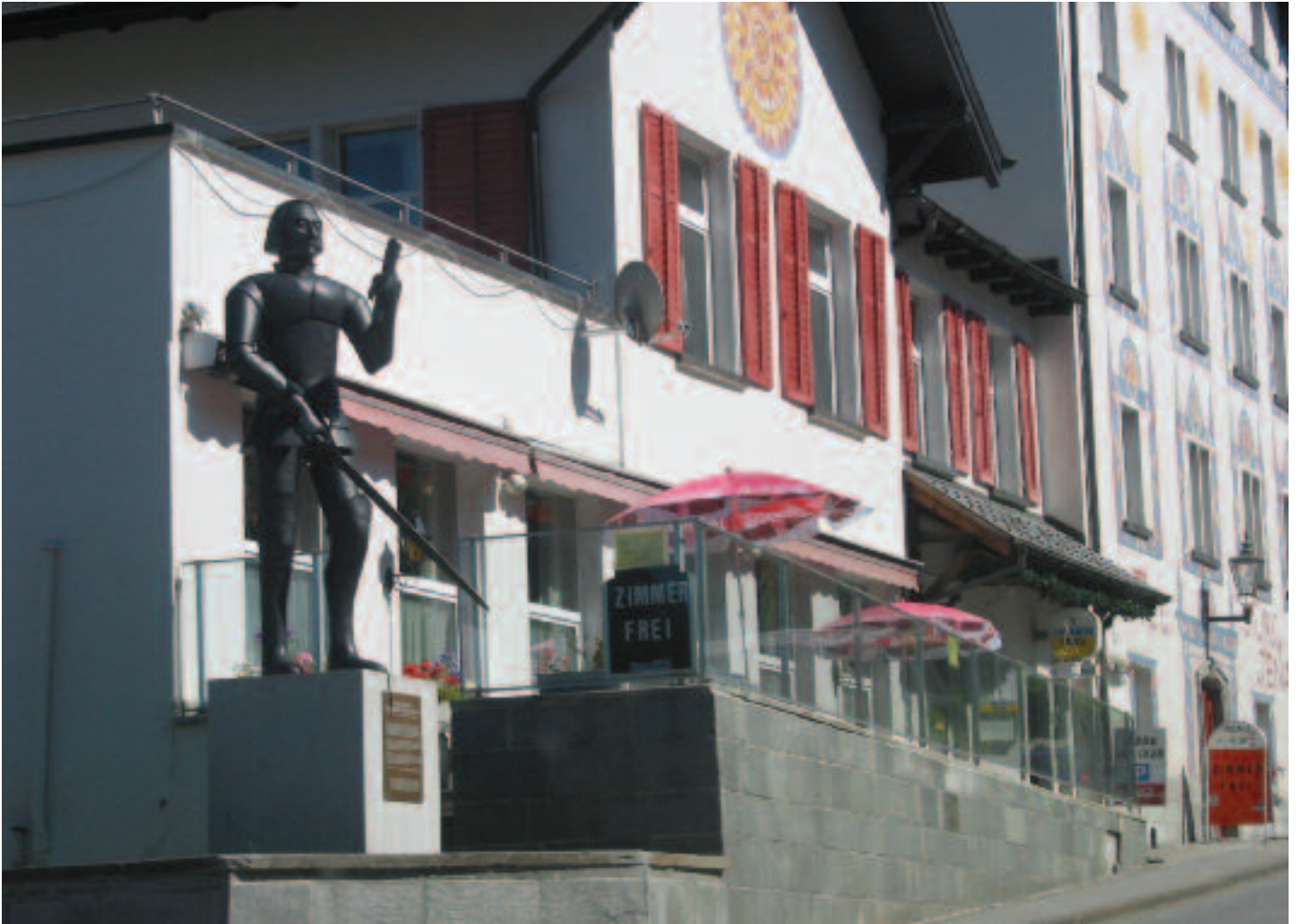
An ancient Swiss hero stands guard in Churwalden.