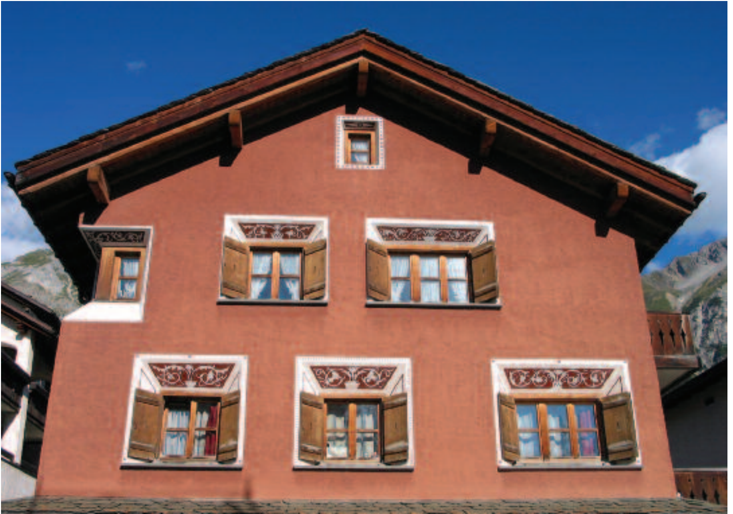
Haus Tano, where I was born