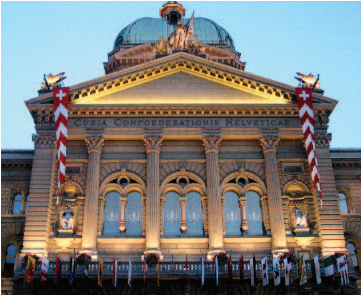
The Parliament House of Switzerland houses the Federal Assembly and Council