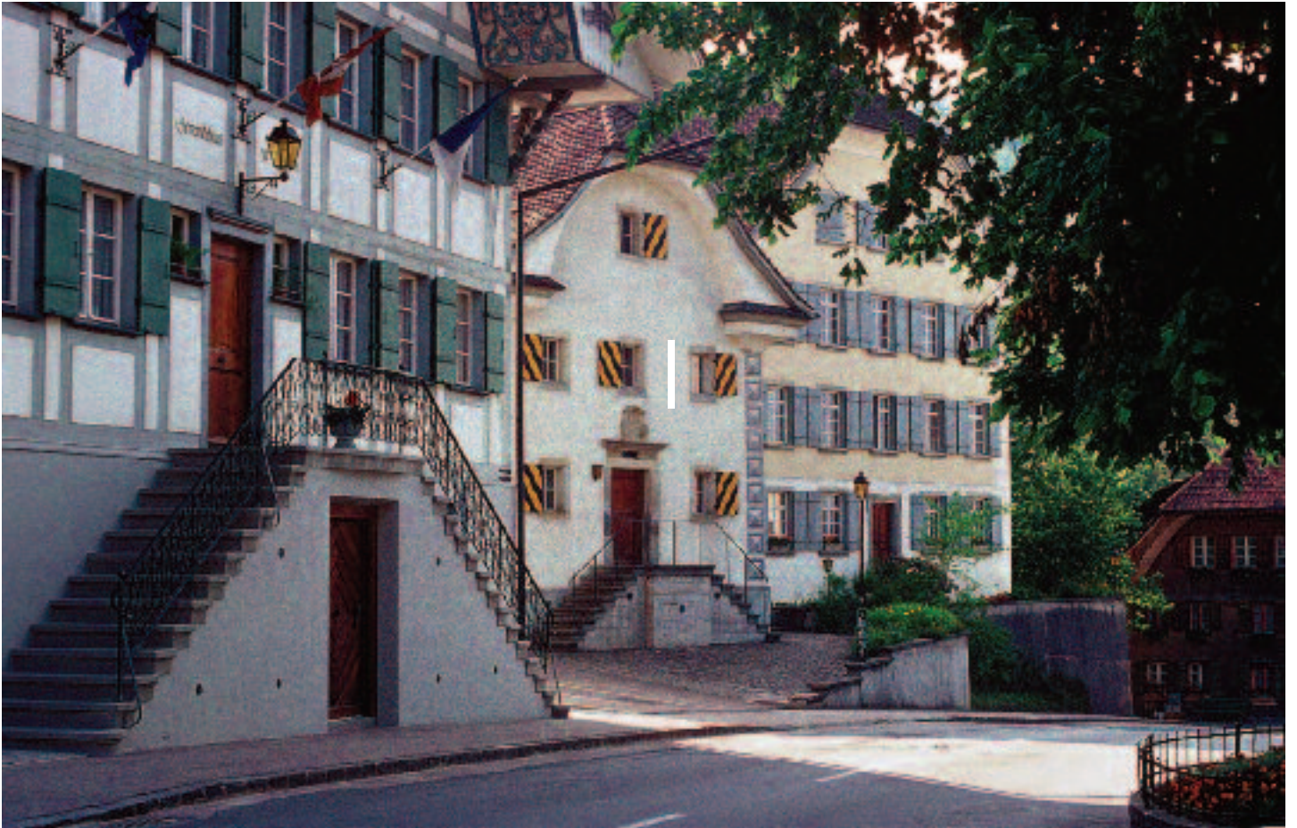
A typical Gemeindehaus (Town Hall)