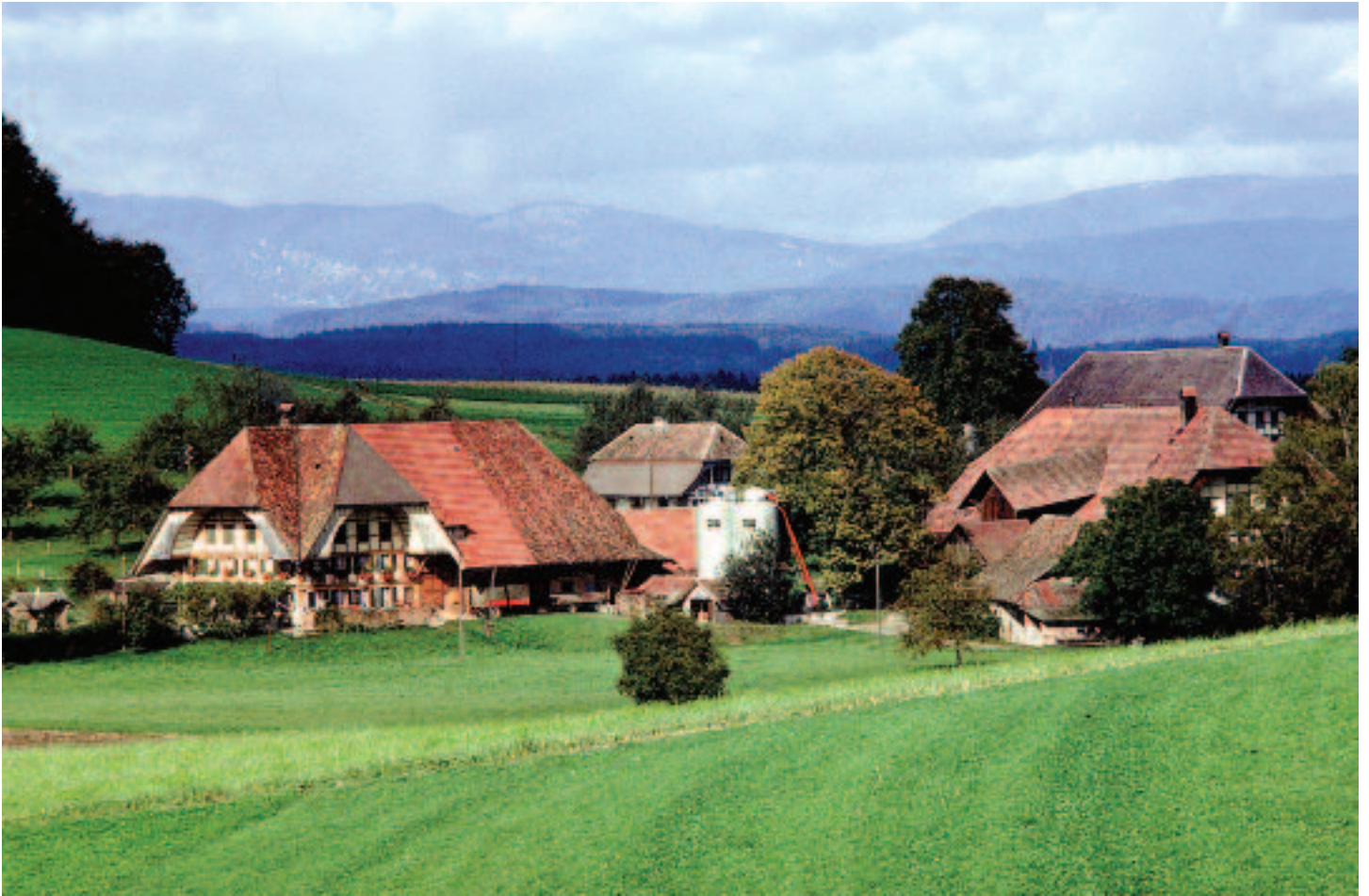
Farmhouses with their characteristic roofs