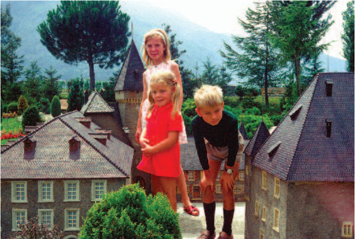
Exploring "Swissminiatur" in Melide