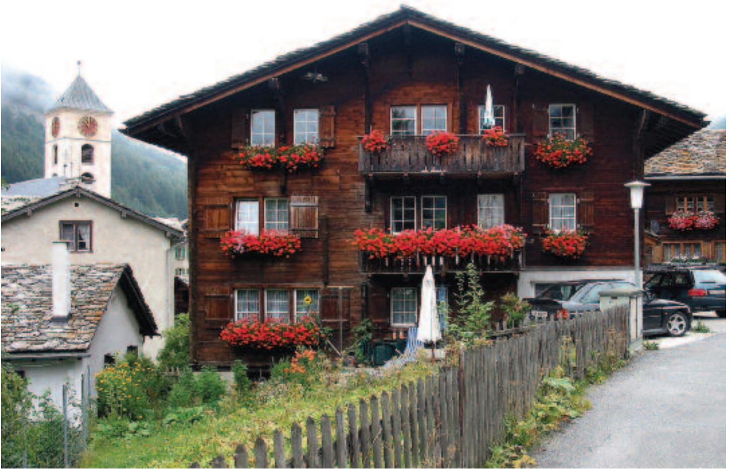
Swiss people love to beautify their houses with flowers