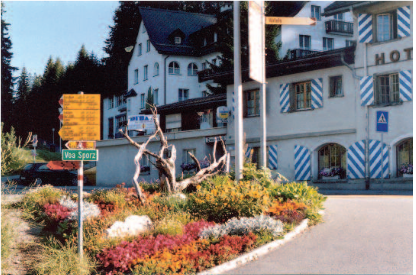
Hotel Danis, Lenzerheide