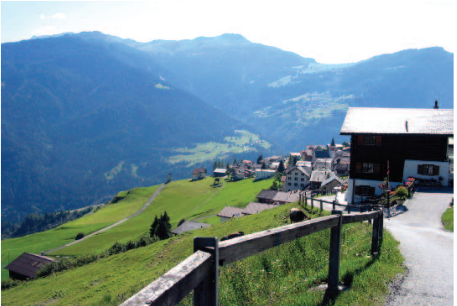
View of Obervaz with its famous blue air