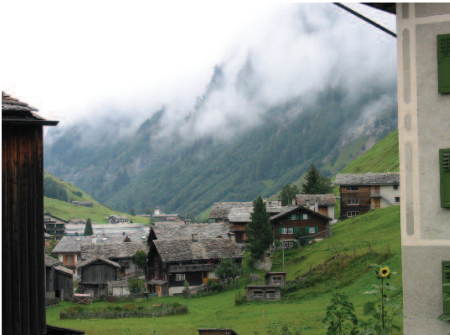
Deep in the valleys of Ticino