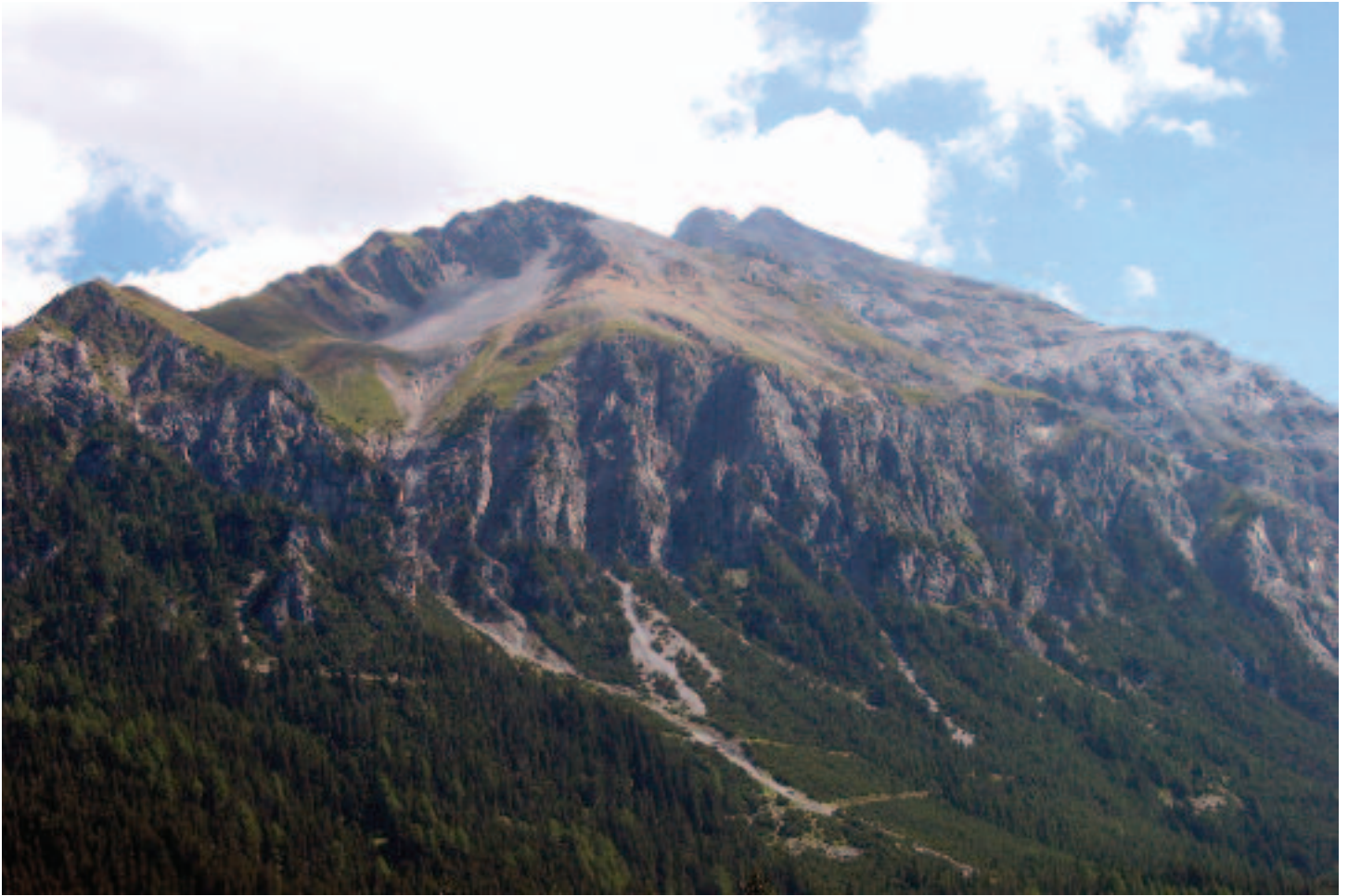
Lenzerhorn (9,534 feet high) showing the tree line underneath ancient erosion