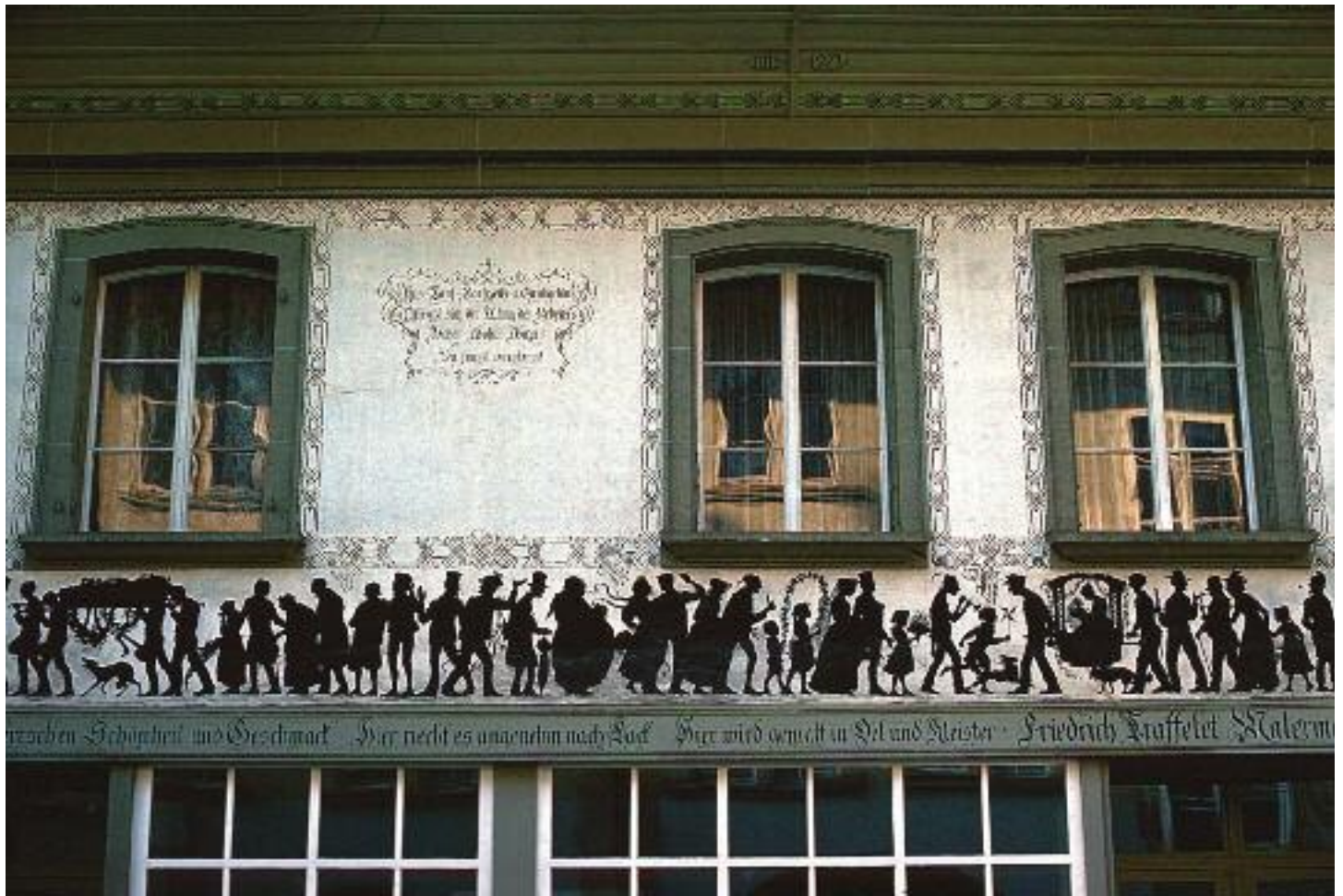
The atelier of Swiss artist Friedrich Traffelet in Berne