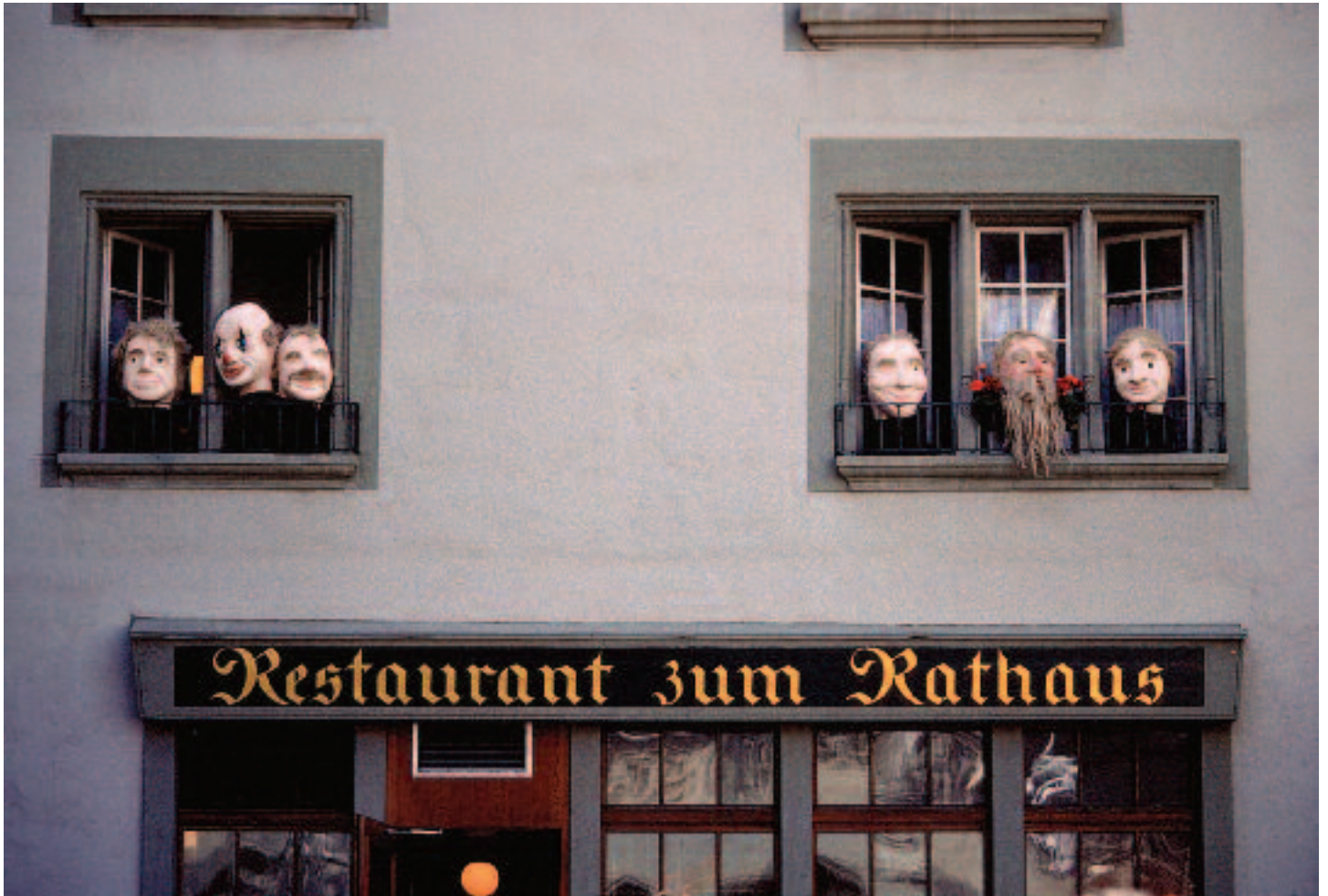
Swiss humor - talking heads at the "Rat"(Council) House