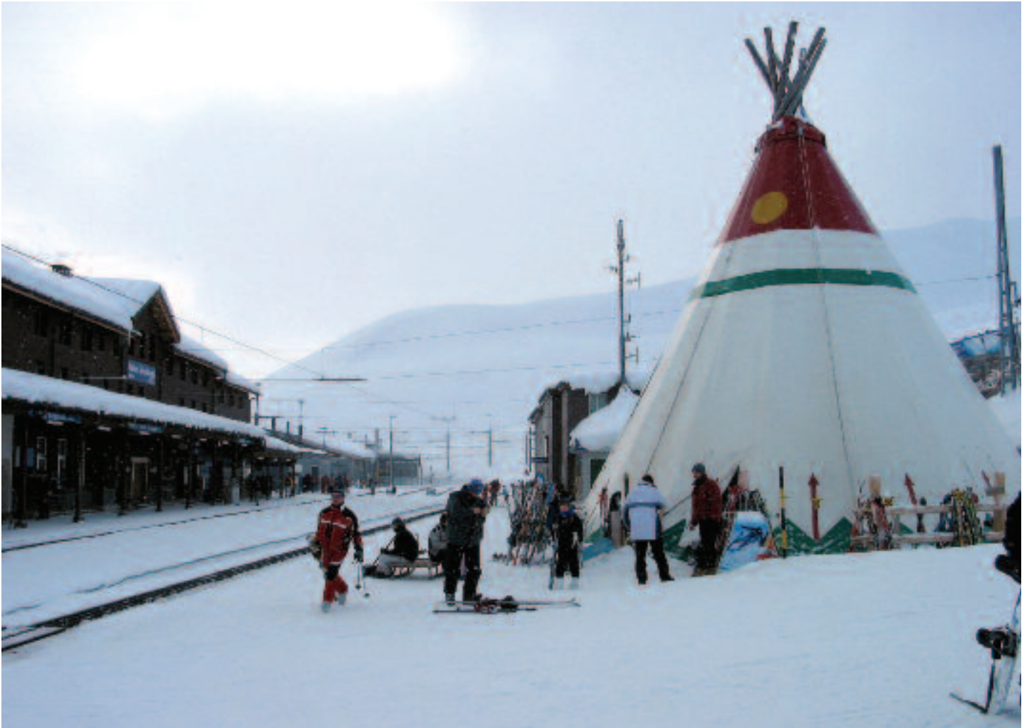
The Swiss find the uniquely American teepee a practical temporary shelter for local food stalls