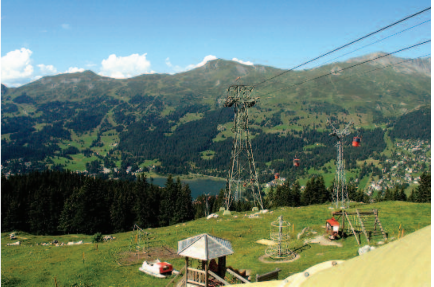
At the top of the mountain, underneath the gondolas, is a friendly playground