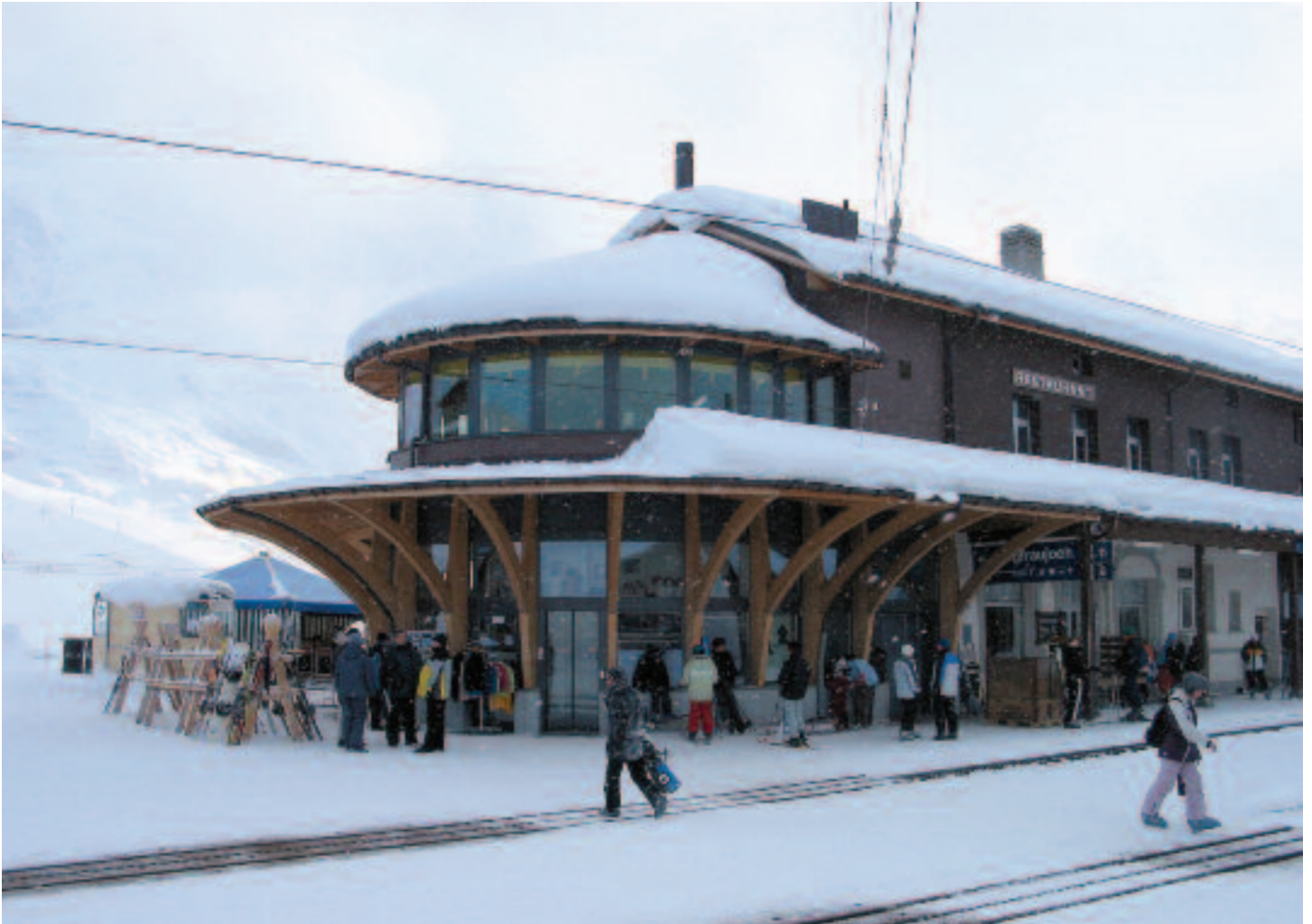
Jungfrauoch railway station is the highest in Europe