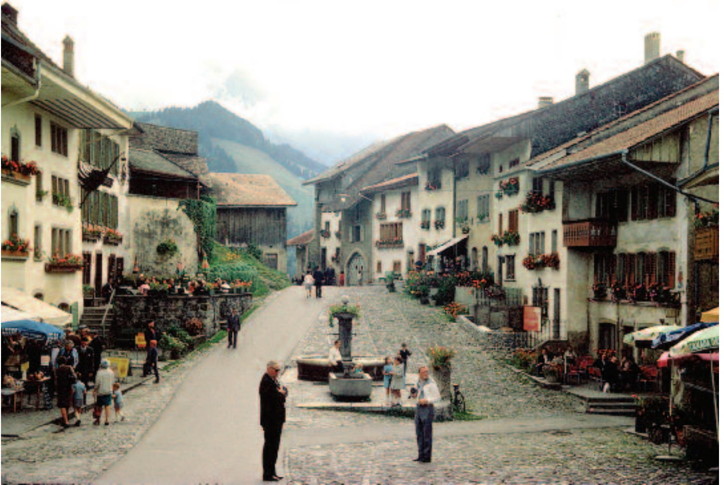
The townspeople of Gruyere, a typical small Swiss town