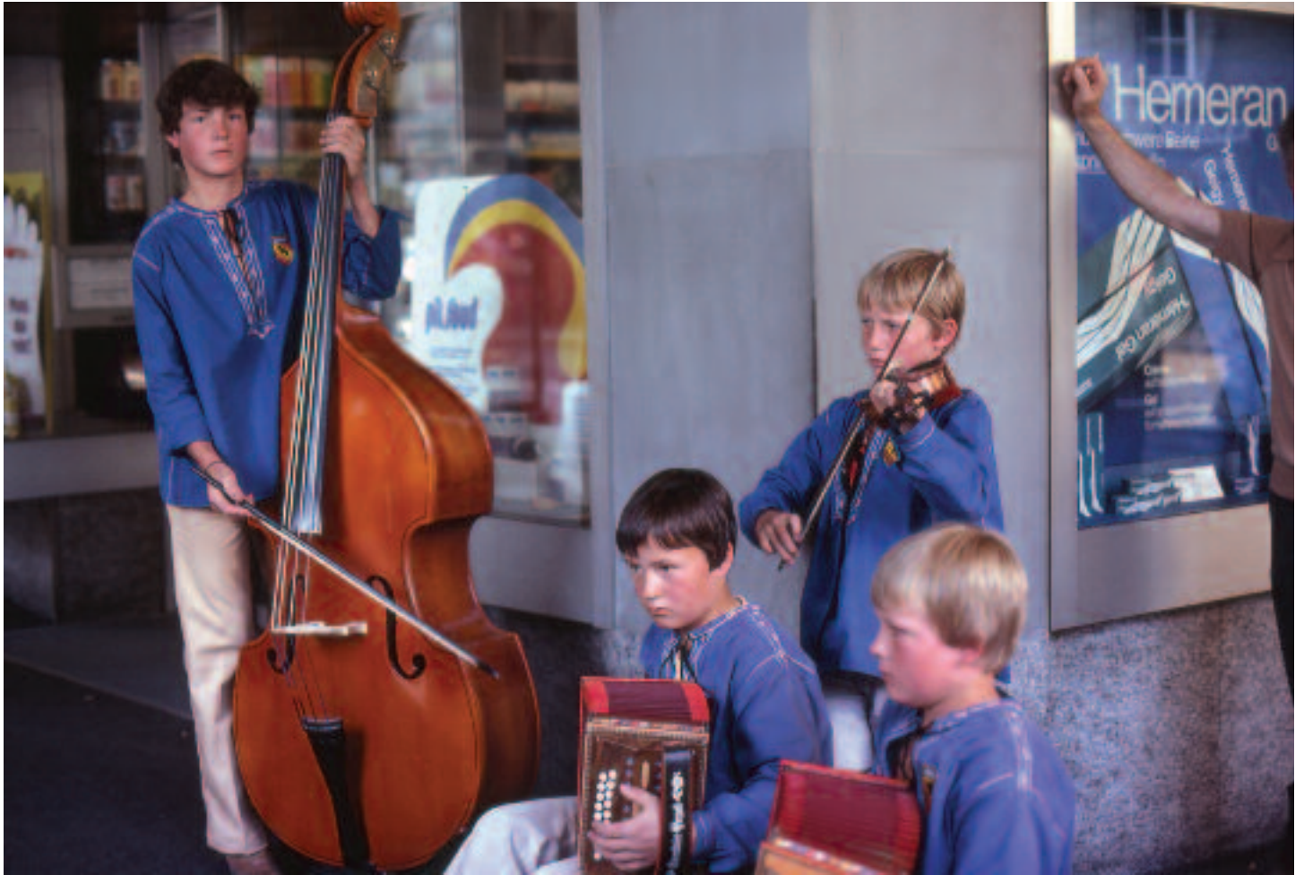
Swiss kids start playing folk music at a young age