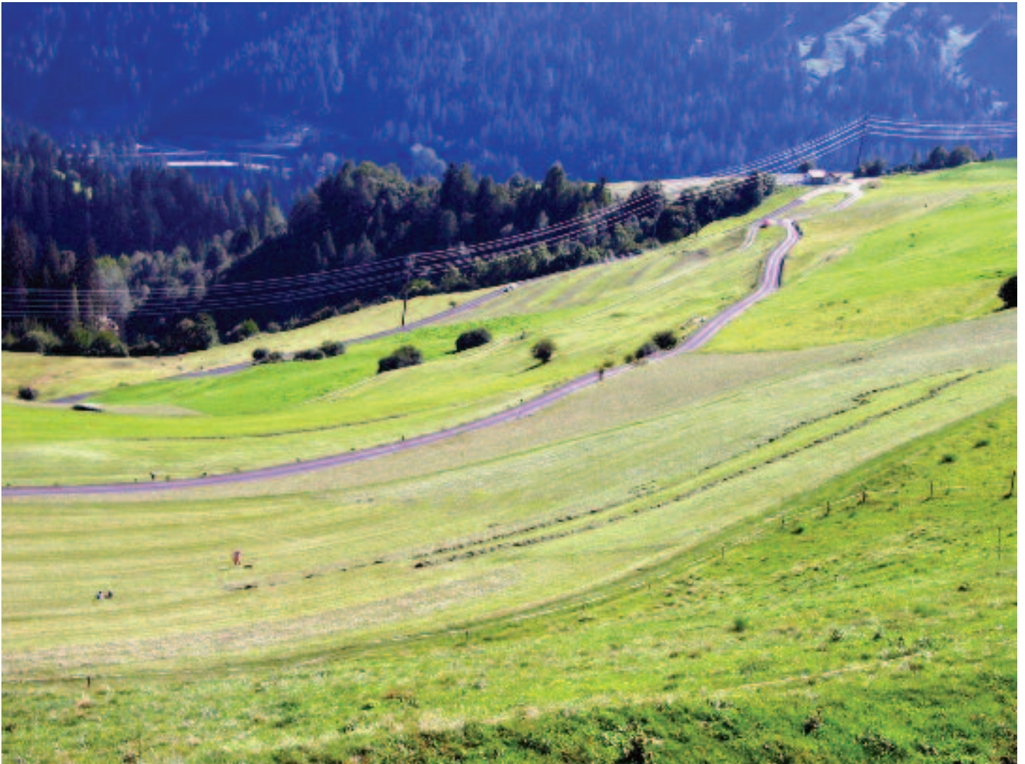
This steep hayfield is one of the few places in Switzerland where electric wires are not underground